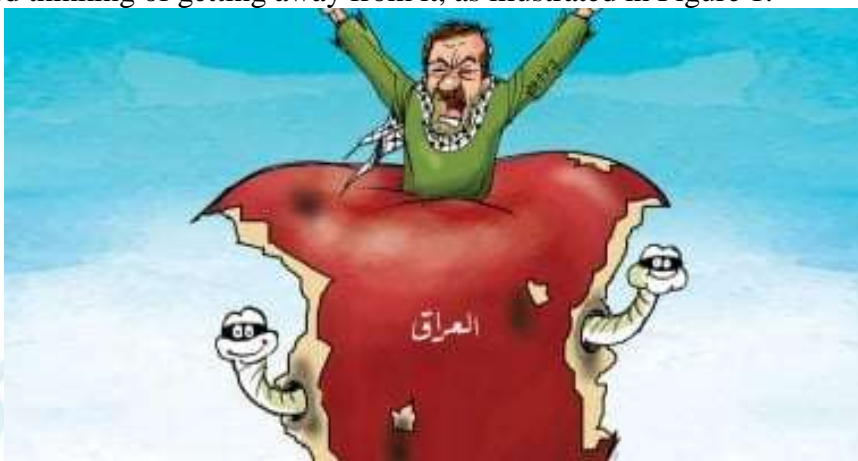
Figure 1. Iraq a stripped off apple https://images.app.goo.gl/z1fN5BfYVYrGj6uo6

As far as the present work is concerned, one caricature-image has been selected from an Iraqi electronic newspaper titled, “The Seventh Day”. The caricature image has been published on October 20, 2019 to highlight the point that the Iraqi layman is suffering due to the destruction and deterioration that hit most of its infra-structures to the extent that he has started thinking of getting away from it, as illustrated in Figure 1.