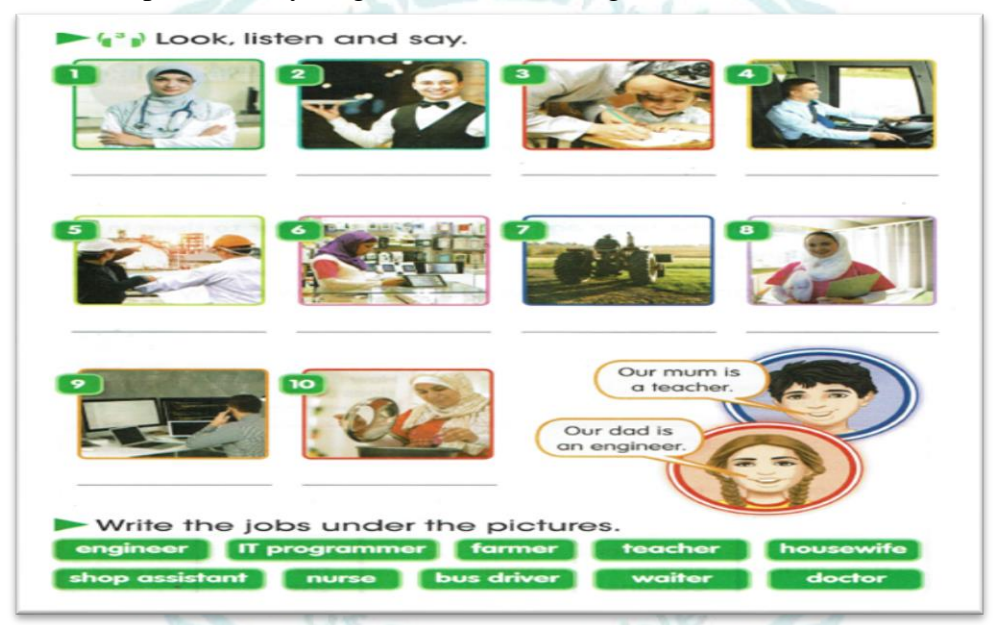
Figure 4. Image instantiates text (6<sup>th</sup> primary - unit1, lesson2 Jobs: p. 8)

2) Complementarity: augmentation, the image extends the text